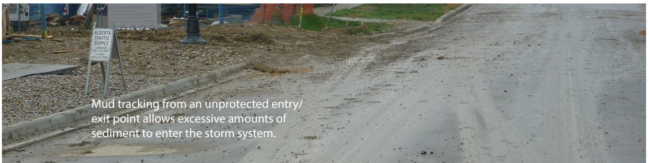
Mud tracking from an unprotected entry/exit point allows excessive amounts of sediment to enter the storm system.

Finally, an Environmental Construction Operations Plan ( ECO Plan ) should be put in place. It identifies how waste will be managed, what chemicals will be used, what you will do if there is an emergency, and so on. The ECO Plan is also your opportunity to record special site characteristics like wildlife corridors, drainage pathways, habitat for sensitive species, any archeological or contamination history and what you plan to do to account for them.