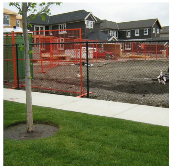
TOP: Perimeter control: Filter log with stakes.